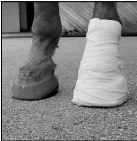
Ultimate Applied with Cotton Bandage