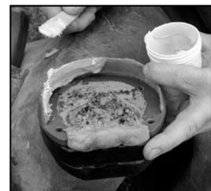
Left: Cutting a depression in the Advance Cushion Support. Right: Applying EquiloX to the felt-covered cuff.